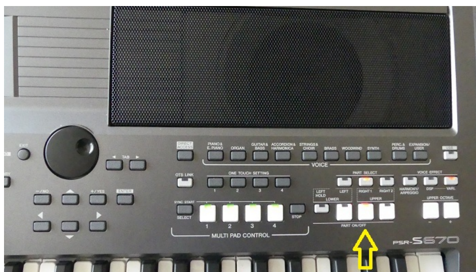
Part Select Buttons